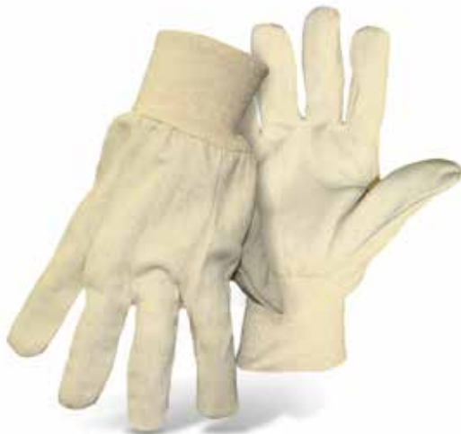
BOSS 100% Cotton 12oz with Knit Wrist Part Number 1JC17012

Straight Thumb Double Woven For Warmth And Longer Wear Flexible Knit Wrist High-Quality Construction 18 Ounce Napped Cotton