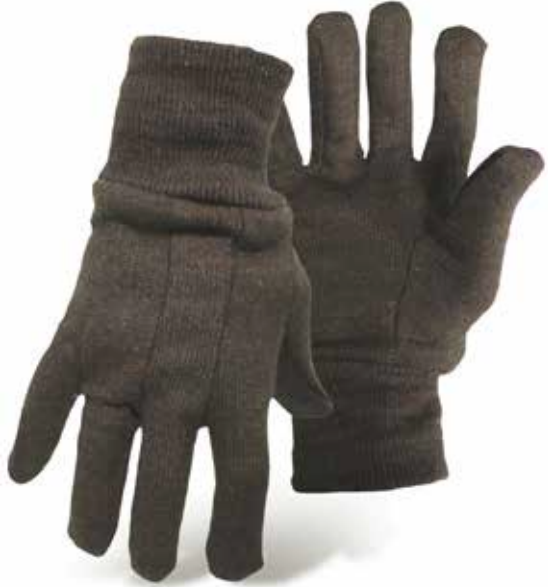
BOSS Brown Jersey, 100% Cotton Part Number 403

Clute Cut Design Knit Wrist Medium Weight Brown 100% Cotton Straight Thumb