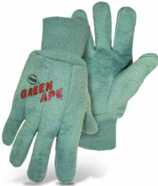
BOSS Green Ape Chore with Flexible Knit Wrist Part Number 313

Clute Cut Design Knit Wrist Medium Weight Brown 100% Cotton Straight Thumb